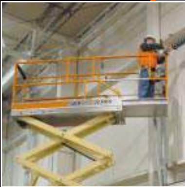
Larger Platforms and Higher Capacities