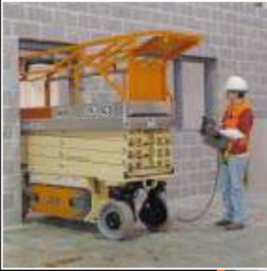
Compact Size and Narrow Width For Ease of Access