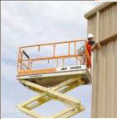
CE Rated for Indoor/Outdoor Usage